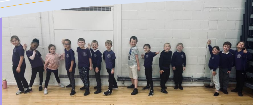
Look at our fabulous Dodgeball team. We are so very proud of them.